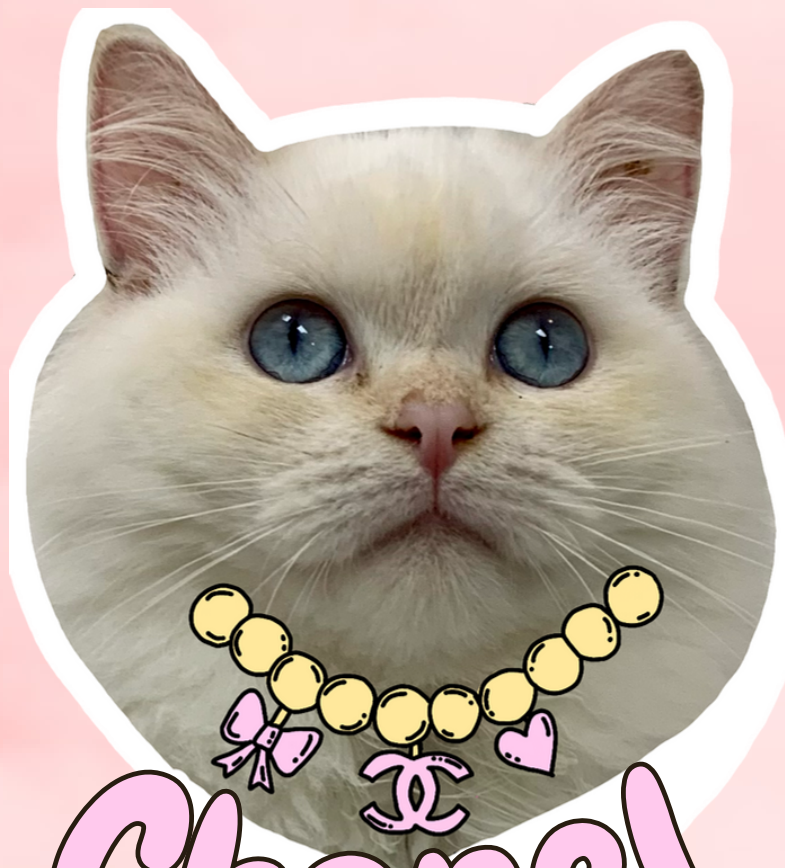
Chanel Himalayan Flame Point Ragdoll

I don't like to be picked up a lot, But I love playing with springs and balls and love being patted. i like to curl up on soft laps and jackets. I'm super cute Mom says.