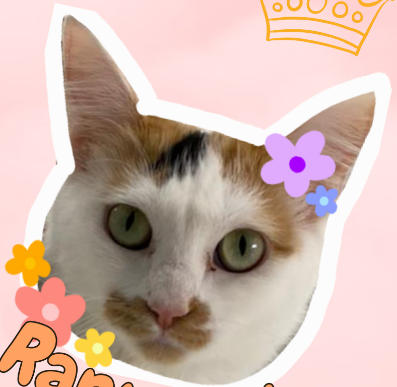
Rapunzel Aka Popcorn

I'm a stunning young Lady. I'm a bit shy at first, but once you get to know me, you'll know how loving, sweet, soft and playful I am!