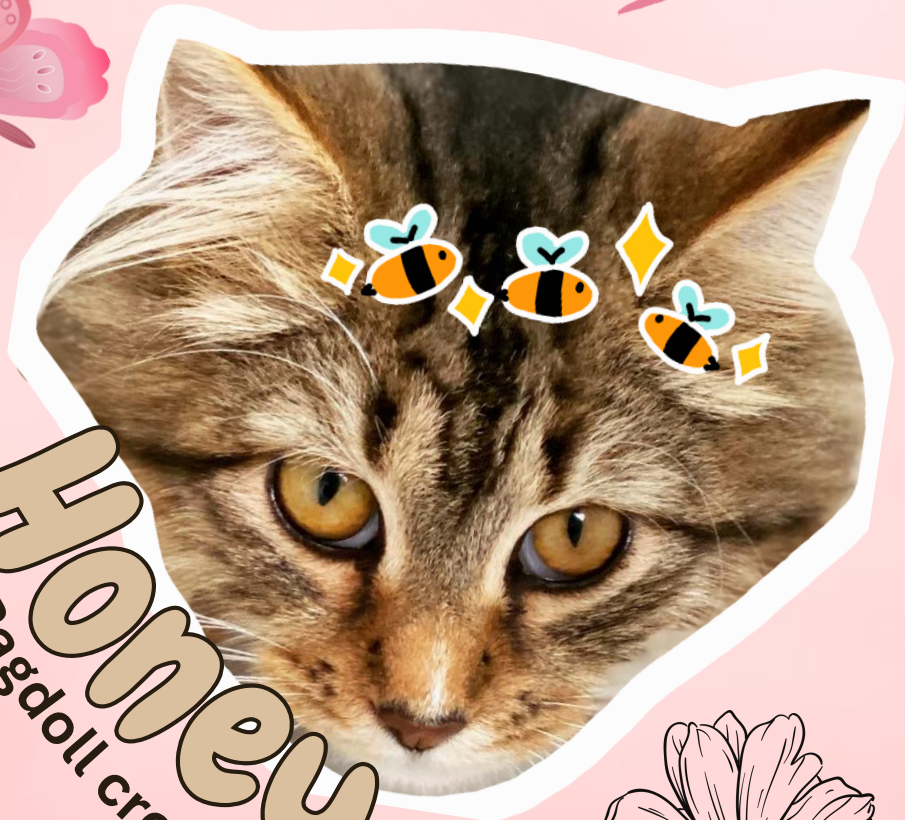
Honey Ragdoll cross

Mom says I'm a bit shy, but I actually only want treats! psst.. I don't like to be picked up a lot, But i would appreciate some pats and rubs. I'm super cute, Mom says.