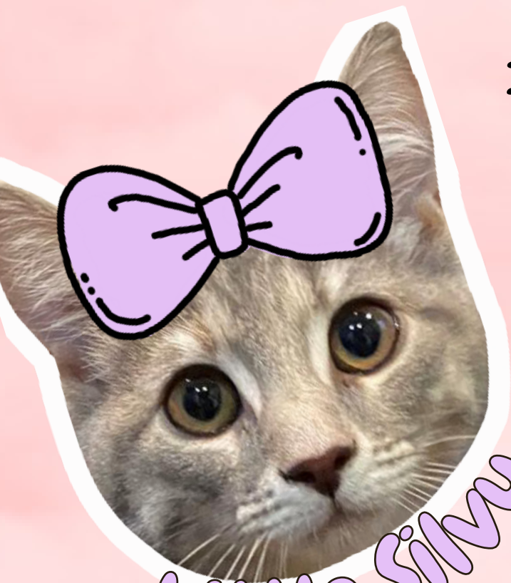
Little Silvy 2023

I'm a stunning Torti. I am not shy at all and will come steal your treats when your not looking. I am pretty cheeky they say so watch out I'm on my way to you!!